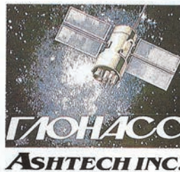
Ashjaee emphasizes that the

Key technical elements of the project include integrating the different timing and geodetic coordinate datums used by the two satellite systems as well as the different L-band carrier frequencies occupied by the GPS and GLONASS signals. Unlike the global positioning system, GLONASS satellites do not all transmit on the same carrier frequency, but instead each satellite has its own carrier frequency within the allocated 1597-1617 megahertz band width.