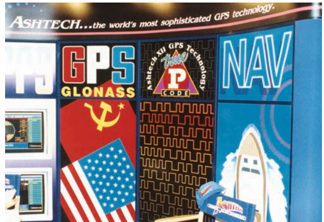
▲ ION 1990 ASHTECH BOOTH displaying U.S.S.R. and American flags.

and financial conditions than the GPS or Galileo teams. But still they were able to make the project successful. The Soviet Union and later Russia went through huge political, economic, social, and geographical revolutions, but the